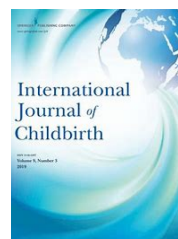
Int. J. of Childbirth