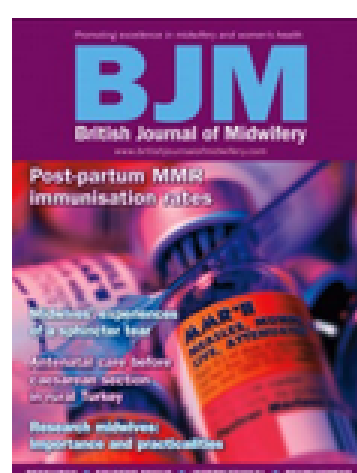
British Journal of Midwives