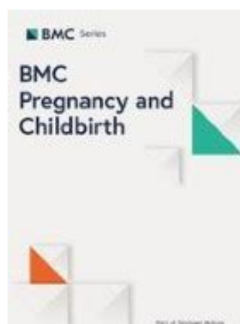
BMC Pregnancy & Childbirth

You have access to online journals using your OpenAthens details. You can browse journals using the NHS Knowledge and Library Hub . Here are some of the journals available to you.