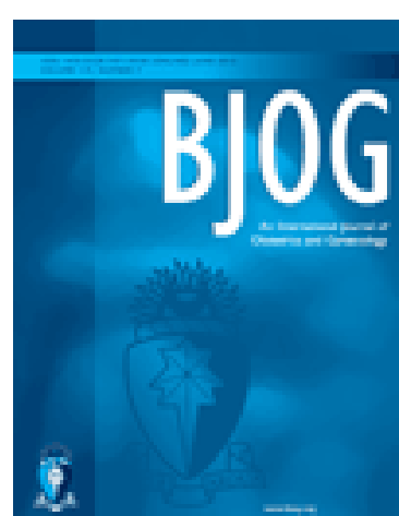
British J. of Obs. & Gynae.